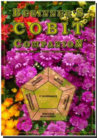
Beginner's COBIT Companion

Beginner's COBIT Companion provides a gentle introduction to COBIT 4.1, the IT Governance framework from ISACA; it contains a wealth of useful information for any reader new to the subject.